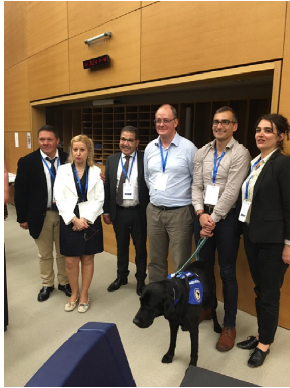
Lol in the European Parliament, taking part in the Annual Conference of Victim Support Europe with representatives of France Victimes, Handi'Chiens and Prosecutor office.

While Lol was working with his first clients, VSE was working with FYDO partners to develop a first EU transnational project that would train several dogs and place them in different working environments to support victims of crime, and that would conduct research to collect evidence, not only on how facility dogs interact with victims, but also how they affect their human colleagues.