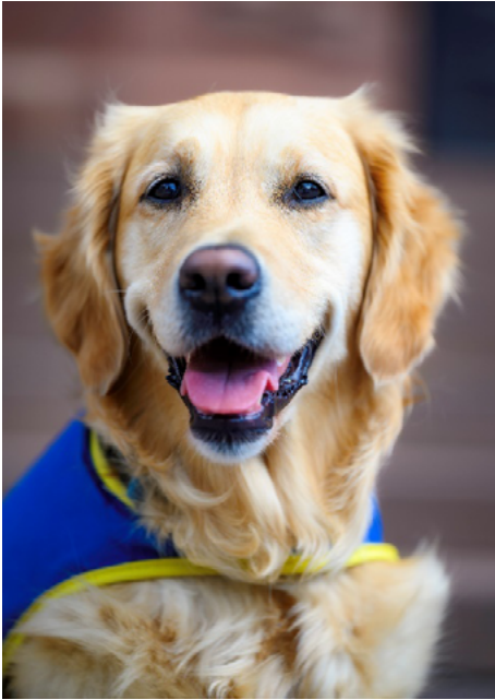
Orphée, trained by Handi'Chiens, working with France Victimes 67 - Viaduc in Strasbourg France