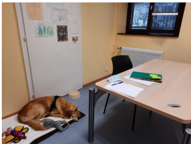
Orphée, trained by Handi'Chiens, France, working with France Victimes 67 - Viaduc, France

To ensure the dog is as comfortable as possible, a second bed and water dish, as well as additional toys should be placed in the room where the dog interacts with victims.