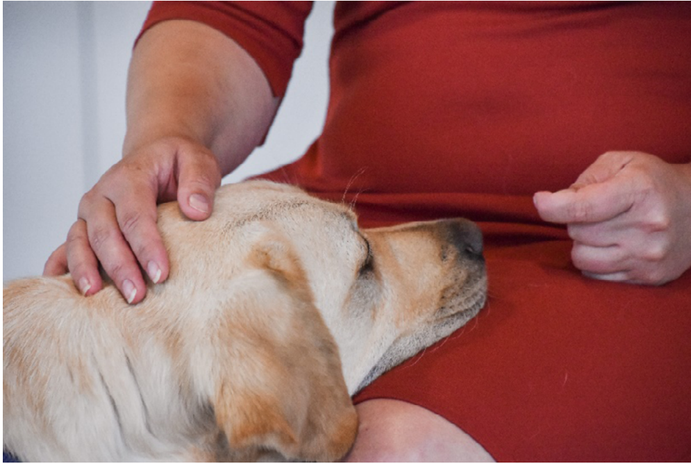
Fluf, trained by Canisha&Hachiko, Belgium, practicing the 'Rest' command

A couch can help the victim and dog sit together, at the same level. It should be long enough to allow a victim move closer or farther away from the dog depending upon their comfort level. Some victims prefer to look at the dog, rather than the interviewer, when describing a stressful event. Others derive more comfort by petting the dog. Some victims hold onto the dog's leash and rub their fingers across its surface or play with it to reduce stress, rather than looking at or touching the dog. Children and persons with disabilities may unexpectedly touch a dog in an intrusive manner or engage in unusual behaviour during the interview. A FYDO dog's training greatly decreases any adverse consequences resulting from such interaction 22 .