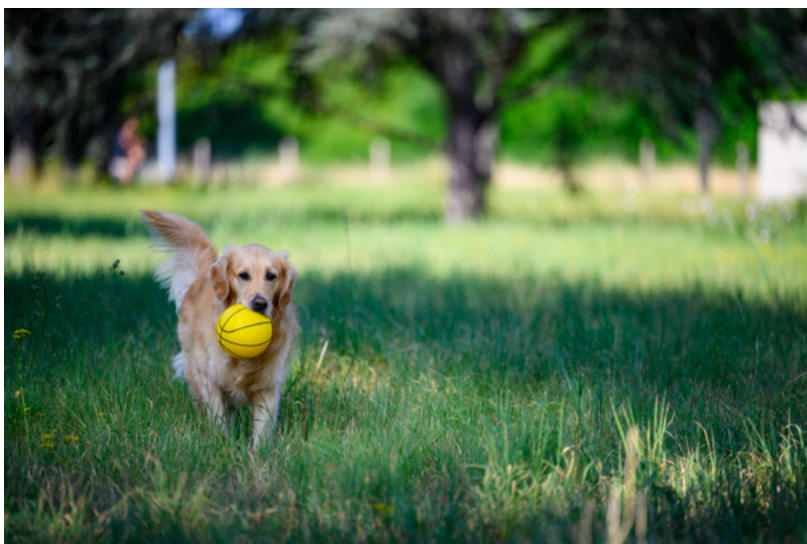
Orphée, trained by Handi'Chiens, France, playing outside