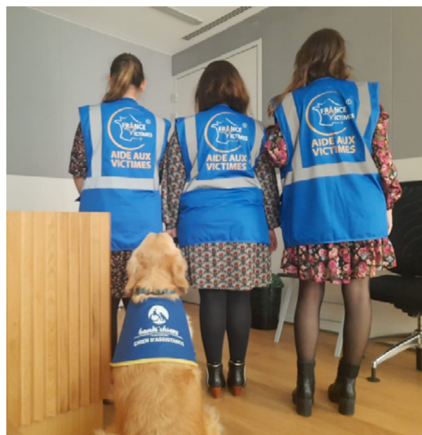
VIADUQ – France Victimes 67 team, Strasbourg

FYDO dogs may be trained to work with generic victim support services (helping victims of all crimes), as well as with specialist services assisting specific victim groups (at shelters for victims of intimate partner or gender-based violence, Barnahus, etc). Dogs may offer reassurance to groups of victims as well as on a one-to-one basis; the level of support and its delivery may differ depending on the situation, support may be required long-term or as a one-off event. FYDO dogs can also be trained to offer comfort when large numbers of people have been impacted by a common event; they may be required to work at victim reception centers, in airports or train stations, public places, tent cities, etc.