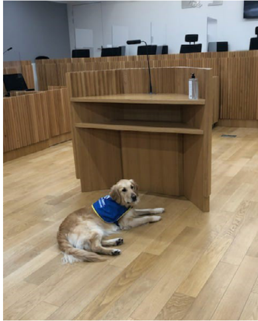
Orphée, trained by Handi'Chiens, working with France Victimes 67 - Viaduc, France, visiting a courtroom in Strasbourg