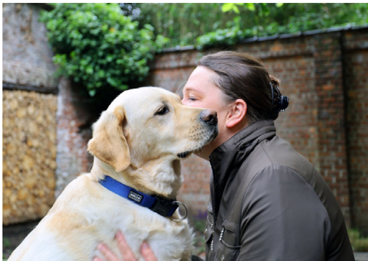
Fluf and its handler outside

Organisations that intend to work with dogs must, therefore, find a suitable colleague, who is willing to share their life with the dog, to give the dog home, to ensure play-time and to provide an ordinary 'doggy life' outside working hours.