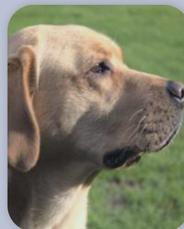
Dog Name: SAM Dog Breed: Labrador Retriever Date of Birth: 02/11/2019