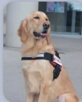
Dog Name: LOVE Dog Breed: Golden Retriever Date of Birth: 28/01/2019