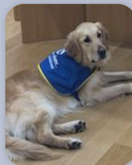
Dog Name: ORPHEE Dog Breed: Golden Retriever Date of Birth: 03/07/2018