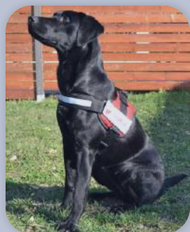
Dog Name: OPHELIA Dog Breed: Labrador Retriever Date of Birth: 07/07/2020