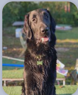
Dog Name: BRIO Dog Breed: Flat Coat Retriever Date of Birth: 04/01/2020