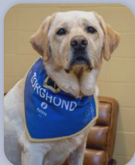
Dog Name: FLUF Dog Breed: Labrador Date of Birth: 08/01/2019