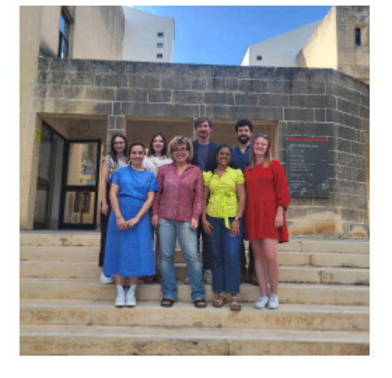
BeneVict - Project Update