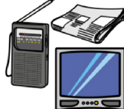
MASS MEDIA PROMOTION

4. We will do activities to make people aware of the importance of defending the rights of people with disabilities.